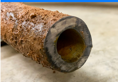
Harvested lead service line