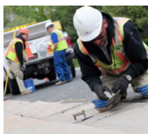
Street and drainage maintenance