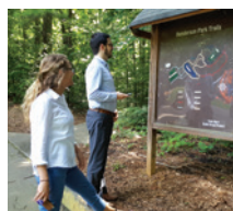
Parks and recreation