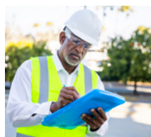
Capital program management