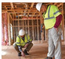
Building inspections and plan review