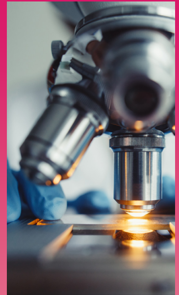
Pharmaceutical and biotechnology