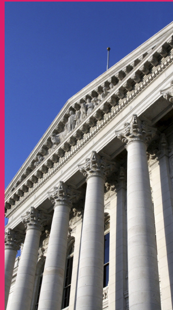
Higher education and municipalities