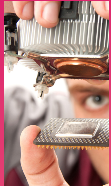
Electronics and advanced technology