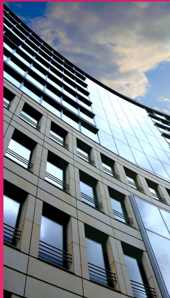
Corporate real estate

Expect solutions that take advantage of proven technology, best practices and expertise drawn from multiple industries.