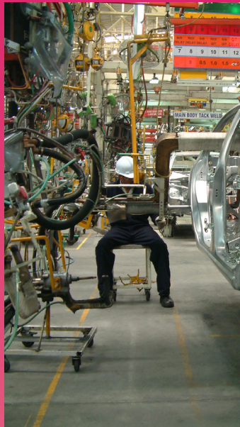
Automotive and manufacturing