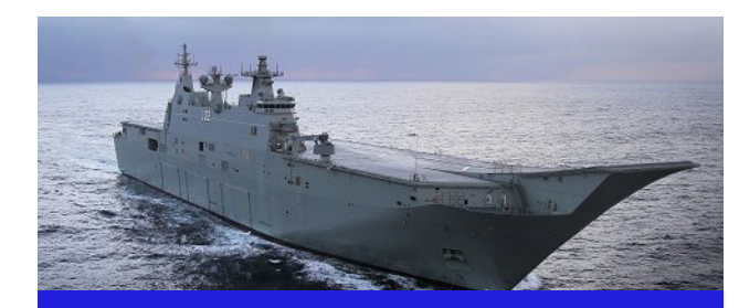
Advancing National Security