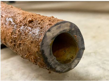
Harvested lead service line

Further, the recent Lead and Copper Rule Revisions have new corrosion control treatment (CCT) requirements for all public water systems in the United States. These requirements include optimization or re-optimization of CCT with review of pH/alkalinity adjustment and/or corrosion control inhibitors (orthophosphate or silica). Additional CCT related requirements include pipe-loop studies for water systems with lead service lines.