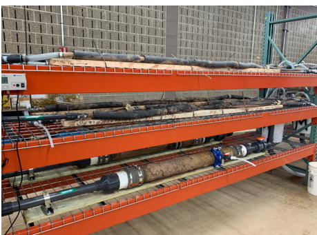
Pipe loop testing rig

Jacobs has a long history of helping municipalities manage corrosion in their distribution systems. Our experience precedes the Lead and Copper Rule in the United States and the Federal guidance and Provincial regulations for corrosion control in Canada.