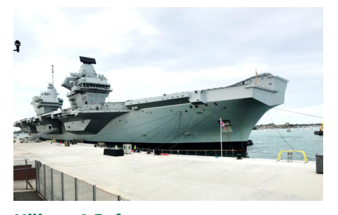
Military & Defense Queen Elizabeth Class Aircraft Carrier Berth Design Portsmouth, United Kingdom