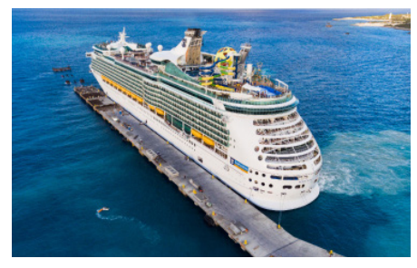
Cruise & Ferry CocoCay Private Cruise Island Pier and Upland Development Bahamas