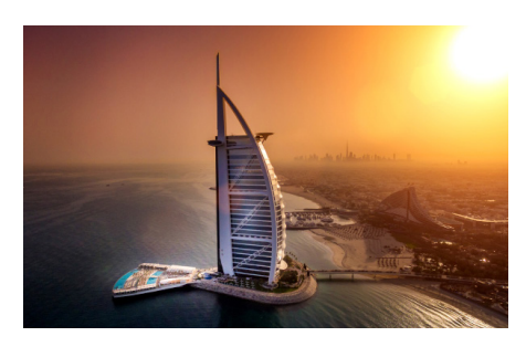
Coastal Infrastructure Burj al Arab Island Overwater Platform Design Portsmouth, Dubai, UAE