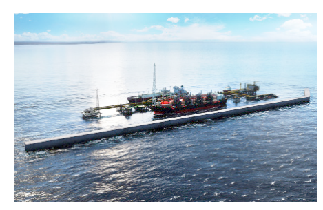
Oil, Gas & Chemicals Tortue Offshore LNG Facility Development Mauritania and Senegal