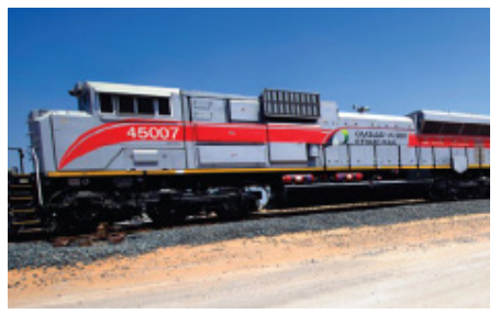
Intermodal Rail Etihad Rail National Railway Network Expansion Technical & Program Mgmt, UAE